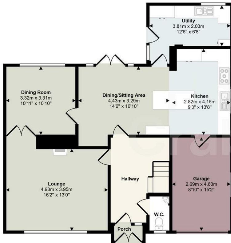
Ground Floor Approx 99 sq m / 1061 sq ft